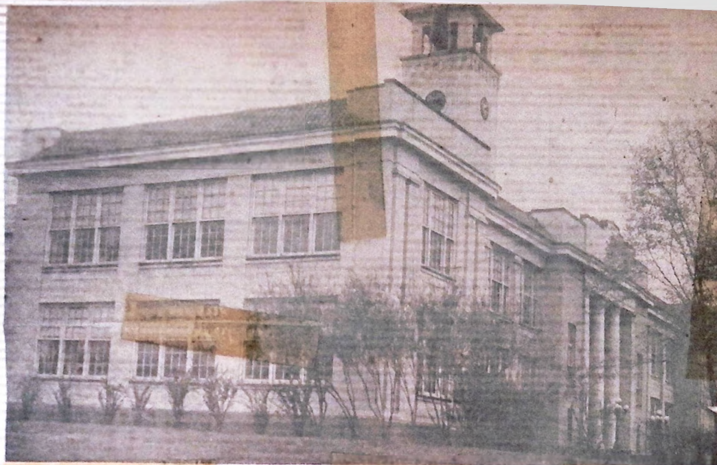
Har-Brack High School

He told the joy of the accomplishment of realizing the importance of an education, of enrolling in the sixth grade at the age of 13 and working and studying relentlessly until he earned his doctorate.